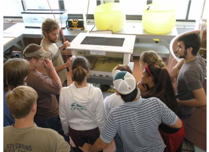
Students observe feeding of the alligators at CCC.

Many students are pursuing independent studies this summer semester; some of the topics are alligator feed making, shark husbandry, native coral husbandry, mass culture of microalgae, bay scallop spawning and nursery culture.