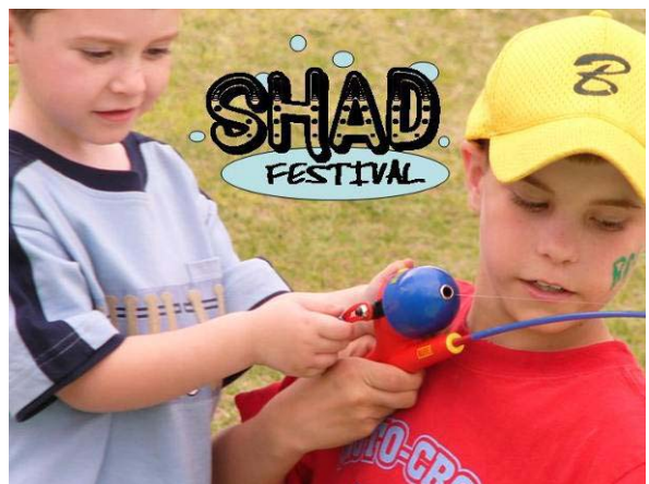
Young anglers in the making at the Grifton Shad Festival!