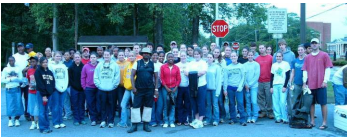
ECU-AFS was the university contact for Clean Sweep, the annual river clean-up project. More than 70 volunteers came out to remove 21000+ trash items from our local waterways!