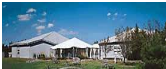
The Univ. Delaware Conference Center.

The University of Delaware's John Penrose Virden Residence and Conference Center http://www.ocean.udel.edu/ships&facilities/virden.html has been selected as the meeting site. This is a great central location, and the facility provides a theater-style meeting room to accommodate 100-120 people as well as a 23 room housing facility with double occupancy@$63 per night per room.