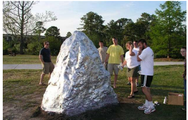
UNCW Subunit members engage in barely-legal advertising for the Subunit.

drum ( Sciaenops ocellatus ) in Southeastern North Carolina.