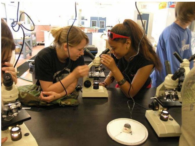
CCC students participate in a microscope study.

We are recruiting new students so if you know anyone who is interested in learning some great skills for applied marine biology, please send them our way.