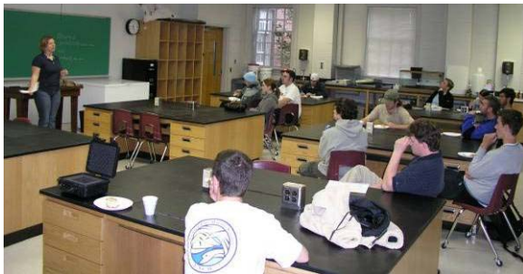
March meeting of the UNCW Subunit