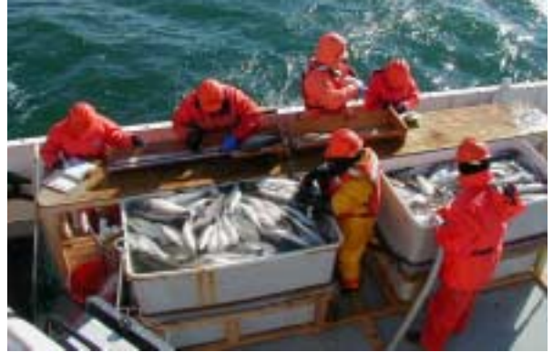
Both running seawater tanks are loaded with striped bass waiting to be tagged and released during the 17 th Annual SEAMAP cruise.