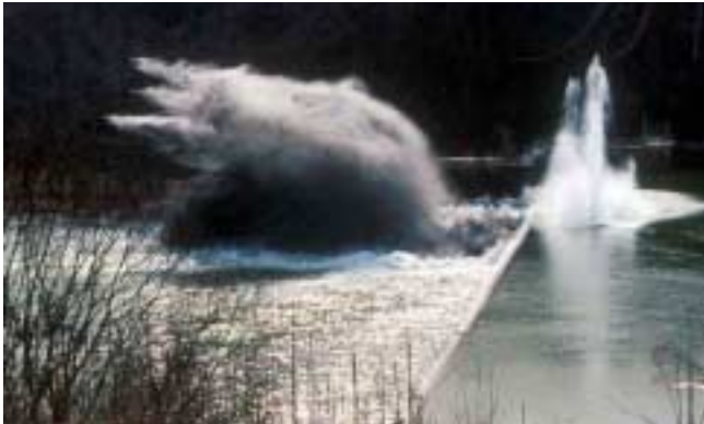
Demolition of the Embrey Dam on the Rappahannock River in Fredericksburg by the U.S. Army Corps of Engineers, February 2004.

heavy machinery. A large section of the crib dam was removed prior to the blast during the sediment dredging operation. The Virginia Department of Game and Inland Fisheries (VDGIF) has been pursuing fish passage at Embrey since the 1980s. In the early 1990's the VDGIF conducted sediment and historical studies that lead to a state funded feasibility study in 1997 that recommended complete removal as the best fish passage option. When the City of Fredericksburg, owner of the dam, announced that the dam would no longer be needed as a water supply the removal option became viable. Also in 1997, Senator John Warner became very interested in the project and began seeking an avenue to apply federal money to the project. In 1998, the Corps became involved and lead a feasibility study co-sponsored by Virginia, Fredericksburg and Stafford County. Warner was successful in securing the funding to conduct the actual project phase at full federal expense. This removal project reopens 106 miles of the Rappahannock and Rapidan rivers that has been inaccessible for over 150 years. The target population for shad is 71,000 based on the amount of upstream habitat that should support spawning and rearing activity. The VDGIF and the USFWS are stocking American shad fry in the upper river to enhance the recovery process. The VDGIF will continue to monitor the river above and below the dam to evaluate the restoration effort.