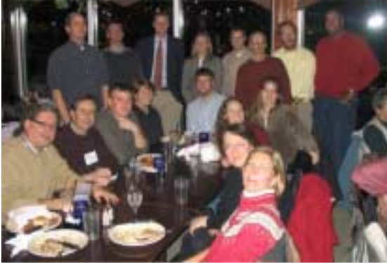
ECU faculty, alums, and students gather at the Friday night dinner social at the Brew River Restaurant on the Wicomico River.