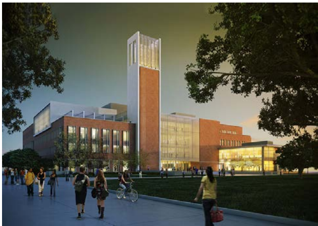
Conference Venue: Guerrieri Commons, Salisbury University