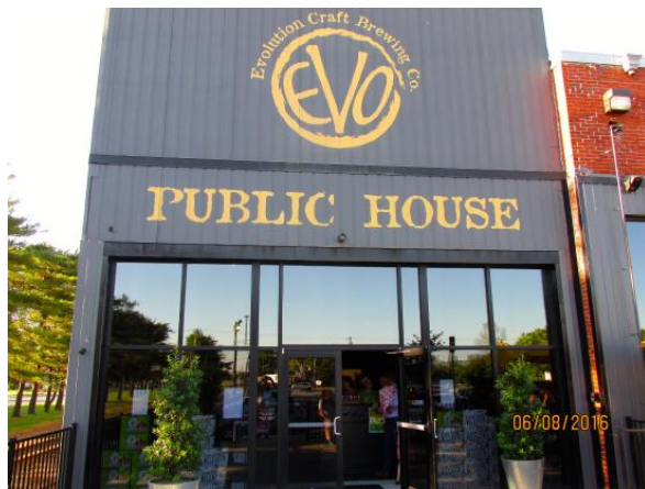
Banquet Venue: Evolution Craft Brewery