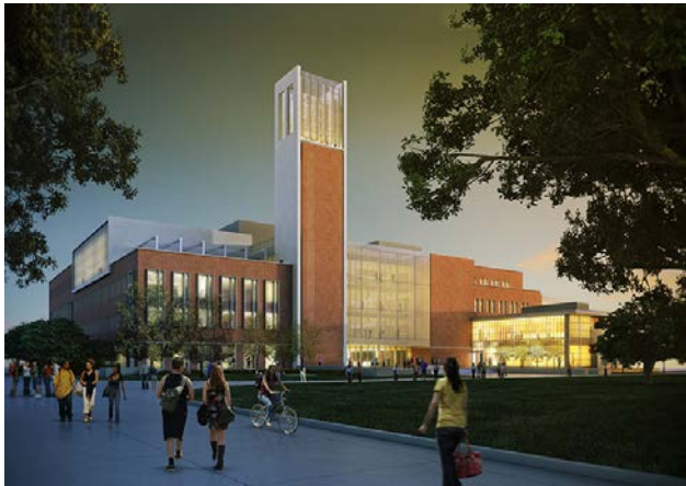
Conference Venue: Guerrieri Commons, Salisbury University

For the 33 rd Annual Meeting of the Tidewater Chapter of the American Fisheries Society